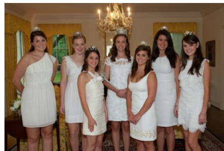
The 2011 Jewel Court: